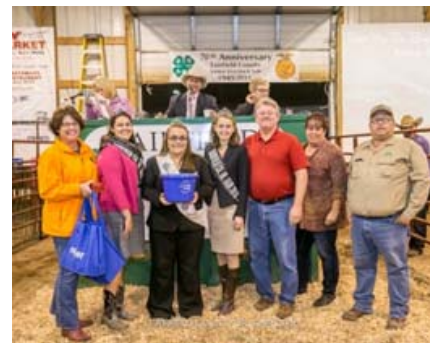
Dairy Products Sale Exhibitor: All Dairy Exhibitors Buyers: Faler Feed Store, Inc, Nfocus Consulting Inc, Ruff's Seed Farms, and Artes Oil Company