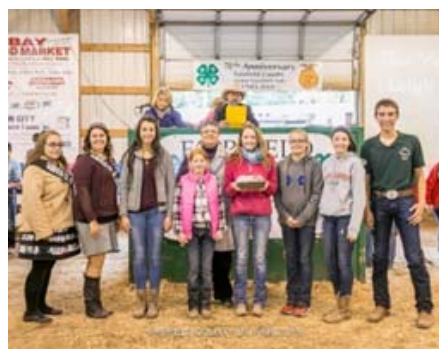
Goat Products Sale