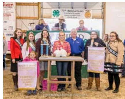
Reserve Grand Champion Pen of 2 Market Rabbits