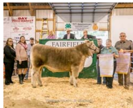
Reserve Grand Champion Market Steer and Reserve Grand Champion Bred, Born and Raised Market Steer