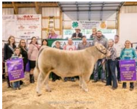
Grand Champion Market Steer and Grand Champion Bred, Born and Raised Market Steer

Thank You to all past supporters & future sponsors, buyers, and Junior Fair supporters in 2016!